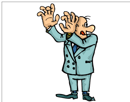
Nervous investors are looking over their shoulders at the volatile stock market of recent years.

Some investors are reacting very badly by avoiding stocks and locking in “yields on bonds that, to me, are extremely poor compared to any historical calculation of stock returns,” Siegel told the