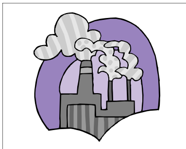
Productive companies increase profits.

Productive businesses, however, are like cash cows, delivering greater quantities of "milk" over the years. "Proceeds from the sale of the milk will compound" just as the Dow Jones Industrial Average went from