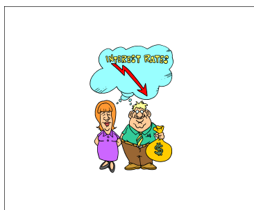
Consumers who have been stung by low interest rates on bank deposits and U.S. bonds may be at risk when using exotic high yield investments.

Mortgage-backed securities also worry FINRA, it said. Because mortgage borrowers are allowed to pre-pay on their loans, investors may have "significant reinvestment risk," meaning they will not be able to reinvest their earnings at the same yield as their original investments.